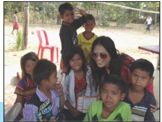
Children attending English class at Grace Center in Takeo Province